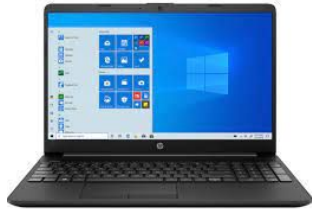
Laptop and charger