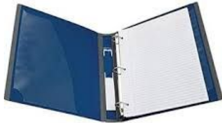
Binder to organize papers for all classes